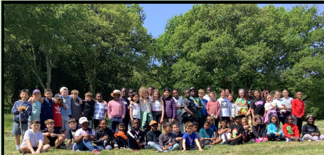
Year 5 had a fantastic time on their residential visit to Frylands Wood Outdoor Centre last week.